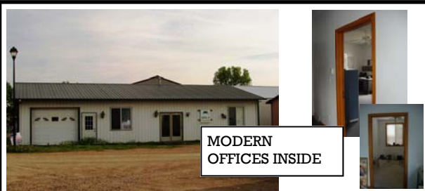
MODERN OFFICES INSIDE